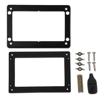
Accessories included with the GX Touch