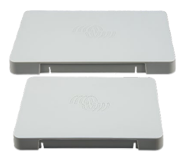
GX Touch 50 & 70 protective plastic cover