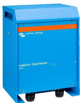
Isolation Transformer 3600W