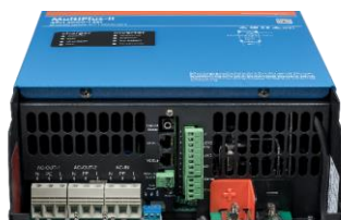
Connection Area MultiPlus-II 4k5