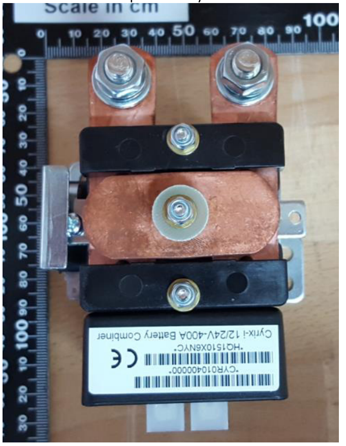
Front view of Cyrix-i